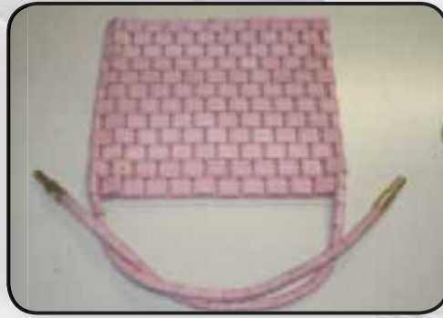
PANEL RESISTANCE PANEL RESISTANCE SNAKE RESISTANCE