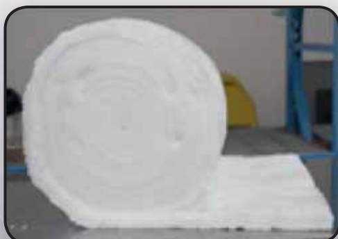
ECO-FRIENDLY CERAMIC FIBER