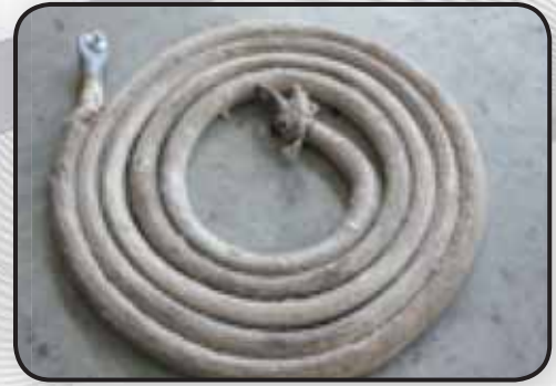
SNAKE RESISTANCE SNAKE RESISTANCE PANEL RESISTANCE