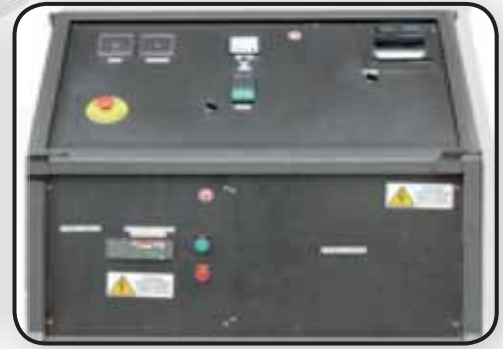
LINE VOLTAGE RESISTANCE MACHINE - LOW VOLTAGE RESISTANCE MACHINE - INDUCTION MACHINE