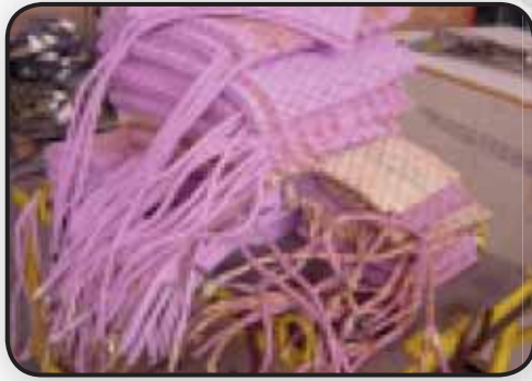
400X850MM 200X1000MM 1700MM LONG