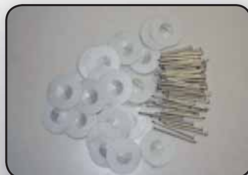
NEEDLES AND WASHERS TO FIX THE RESISTANCES AND THE INSULATION